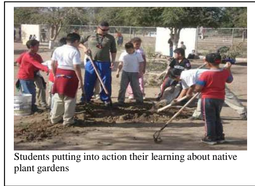
Students putting into action their learning about native plant gardens

An important component of all our trainings is that participants, mainly educators and community volunteers ( Promotores ), commit to designing and implementing a school or community project to benefit the environment. Projects range from native plant gardens to battery recycling, water quality monitoring, and disseminating hazardous substances information. Since 2006, more than 200 projects have been designed and implemented by our workshop participants, and more than 12,000 individuals have participated in such projects.