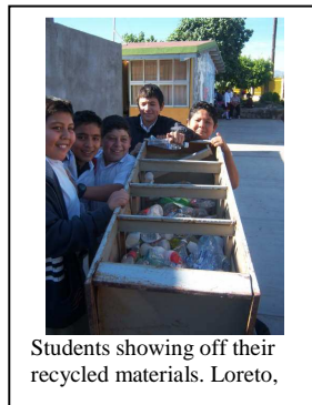
Students showing off their recycled materials. Loreto,