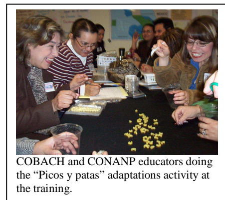
COBACH and CONANP educators doing the "Picos y patas" adaptations activity at the training.

The pilot training was delivered to 41 COBACH (the high school system in Baja California) teachers from 17 schools in the state, one secondary school inspector from Tijuana, and 9 members of CONANP the area in charge of natural protected areas in Mexico. Next steps are to produce the final Spanish curriculum version and translate it into English, as well as to obtain funds to make the program on-going and sustainable.