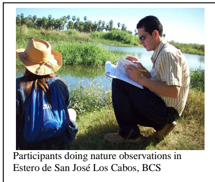
Participants doing nature observations in Estero de San José Los Cabos, BCS

In the fall of 2008 we delivered three regular trainings and a Trainer of Trainers in Nuestro Patrimonio Natural in BCS. We had 23 participants in the regular workshop and seven trainers were trained in La Paz; Loreto had 11 participants, and Los Cabos 30 participants. They are all implementing their projects and field trips. Completion celebrations for BCS are planned for the last week in April. This program, implemented for the past three years with funds from ICF, has served to train 296 educators from Baja California Sur, who in turn teach more than 20,000 students and other individuals in 146 schools and organizations. Each of the participants in the training workshop commits to doing a project to benefit their community's environment, with tangible and measurable results leading to changing attitudes toward the environment for life.