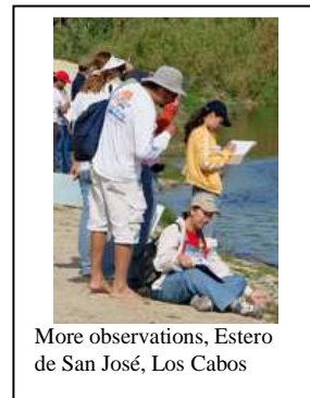
More observations, Estero de San José, Los Cabos